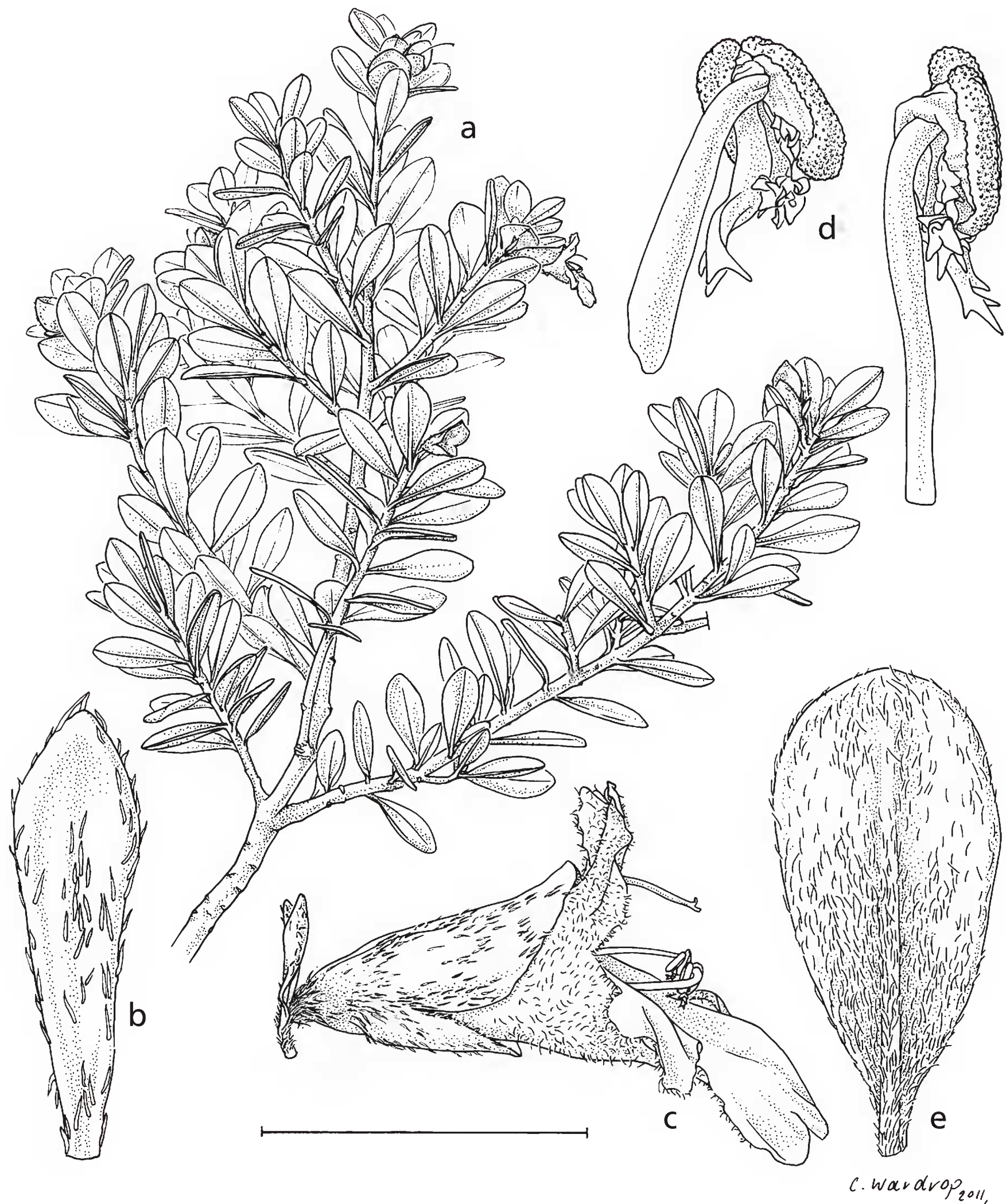
Figure 4. Prostanthera tozerana . a , habit, showing flowering branchlet with flowers and developing fruits; b , detail of prophyll; c , lateral view of flower showing prophylls, calyx, corolla, partial view of stamens, style and stigma; d , stamens showing oblique dorsal view of anther locules, anther appendages and staminal filaments (adaxial stamen – left; abaxial stamen – right); e , leaf, abaxial surface showing antrorse hairs ( B.G. Briggs 7351 ). Scale bar: a = 5 cm; b = 0.3 cm; c , e = 1 cm; d = 0.2 cm.